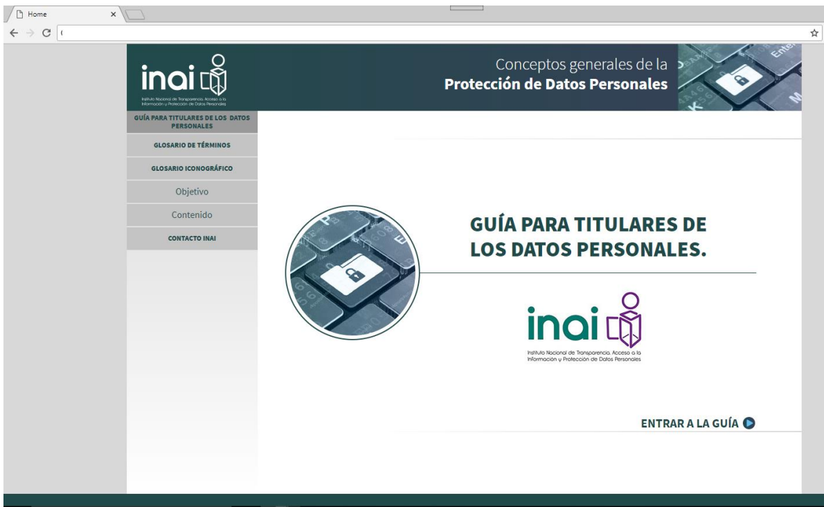
Figure 1. General view of the Webpage, The Guide