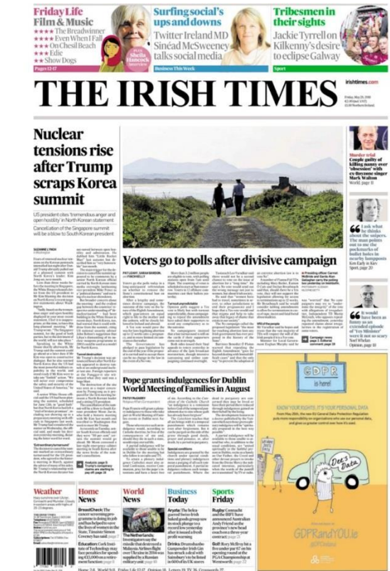
Pre print image of Irish Times front page 25 May 2018