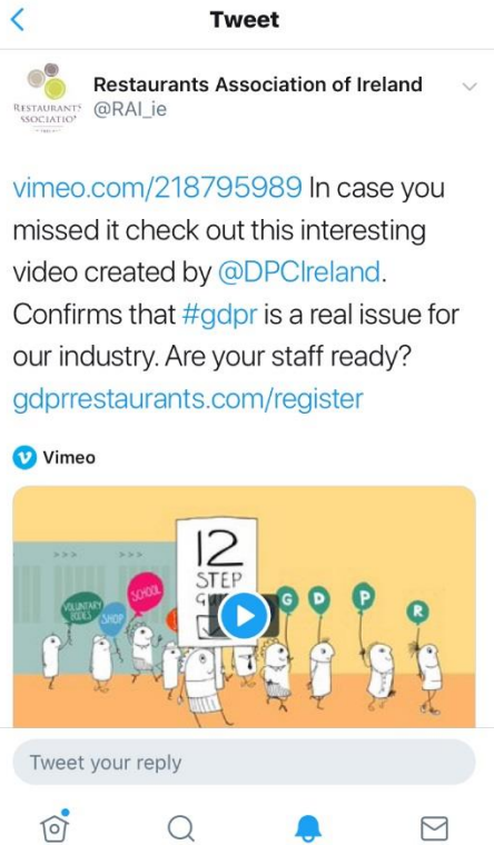
Example of a Tweet highlighting DPC resources.