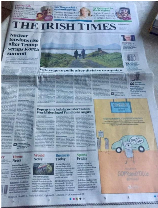
Front page of the Irish Times newspaper as printed on 25 May 2018.